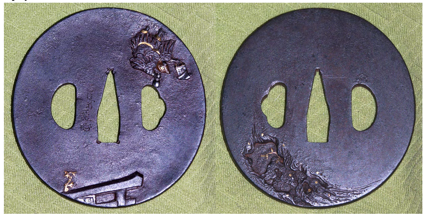
Iron tsuba signed 一龍 花押 <u>Ichir</u>yū w/Kaō. I could find no information for this artist. Decorations in gold, shakudō, copper and silver.

Display items: Note: Photos are not to scale.