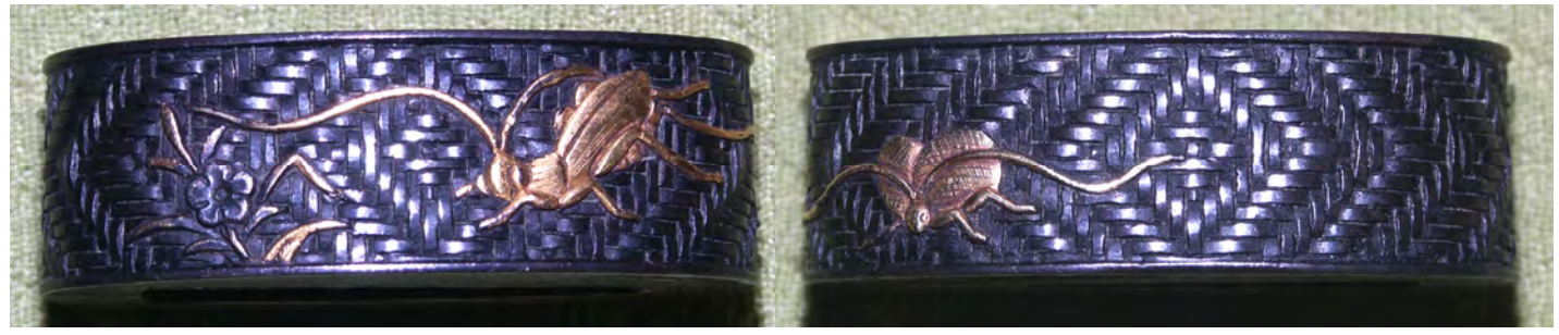
A <u>favorite</u> fuchi having an intricately carved basket-weave ground, with insect and flower decorations. Shakudō ground with gold and silver highlights.