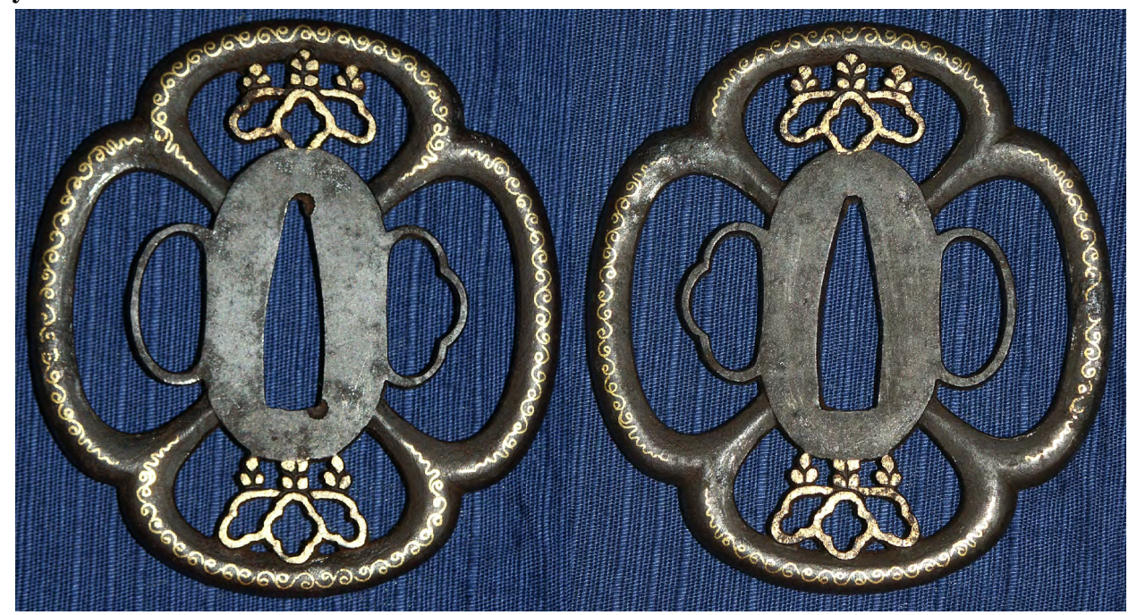
Iron sukashi tsuba described as being Higo Shōami, and having a "shadow" or "kage-kiri" mon. Highlights are in gold.