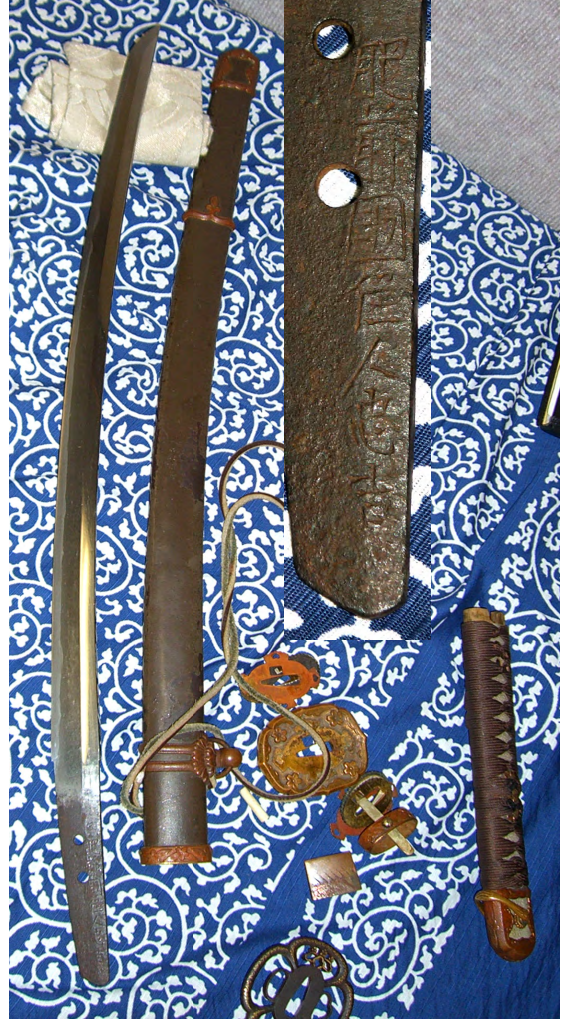
Blade signed katana-mei 肥前國住人忠吉 Hizen Kuni Jūnin Tadayoshi in guntō mounts. No information was presented at the meeting.